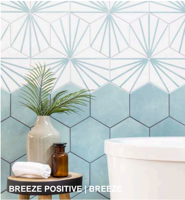
BREEZE POSITIVE | BREEZE