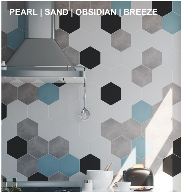
PEARL | SAND | OBSIDIAN | BREEZE