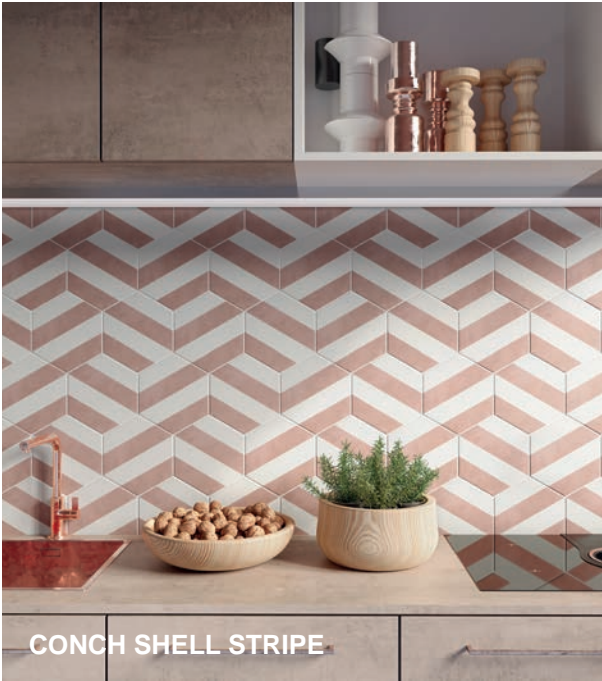
CONCH SHELL STRIPE