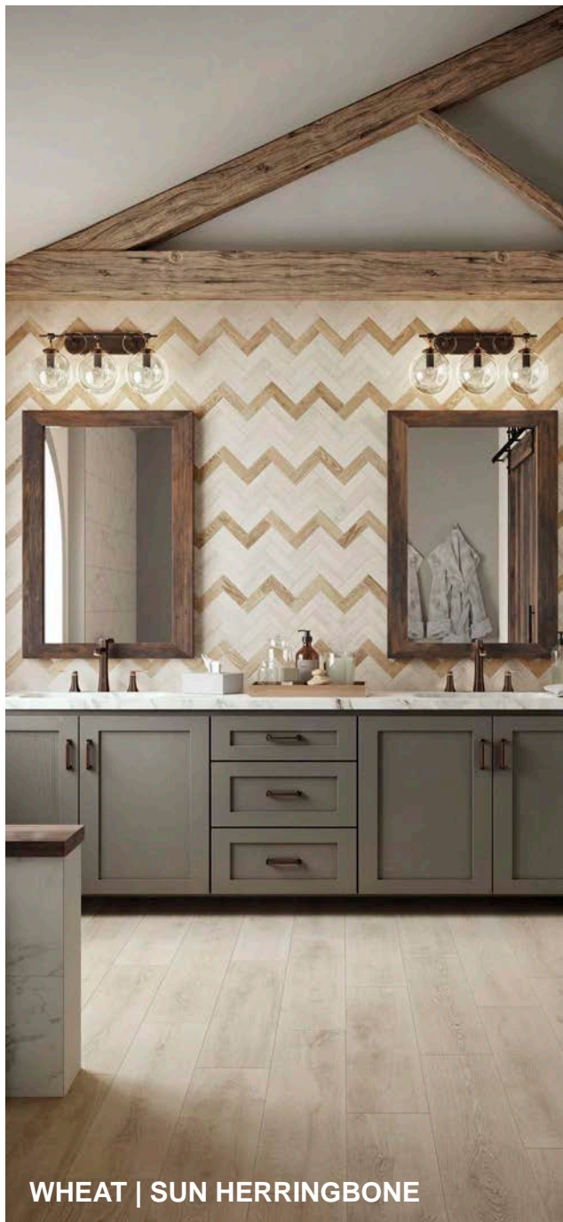
WHEAT | SUN HERRINGBONE