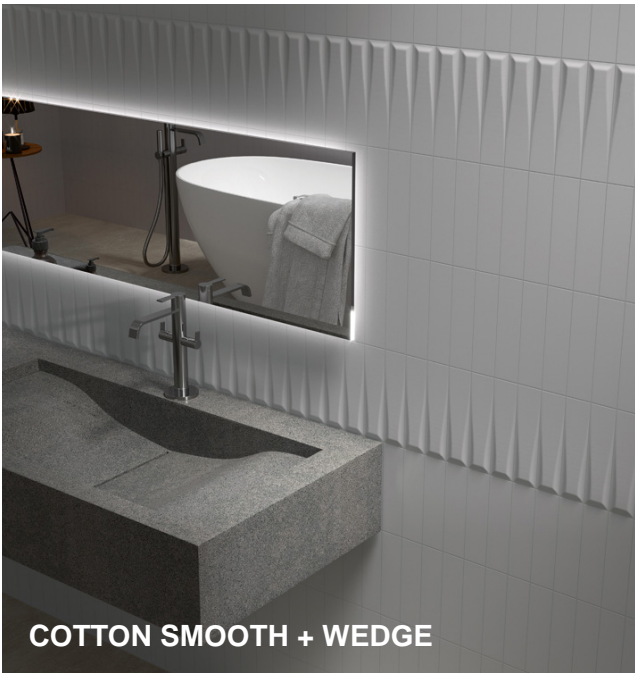
COTTON SMOOTH + WEDGE