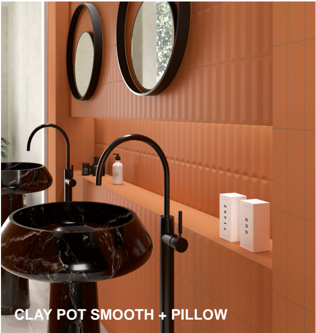
CLAY POT SMOOTH + PILLOW