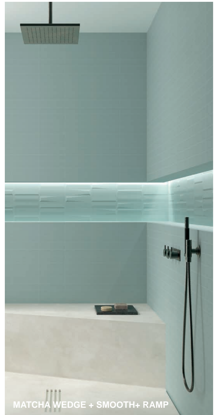
MATCHA WEDGE + SMOOTH+ RAMP