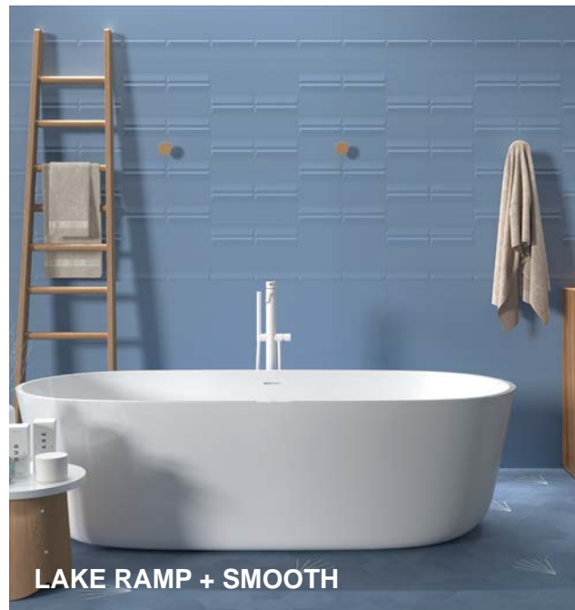
LAKE RAMP + SMOOTH