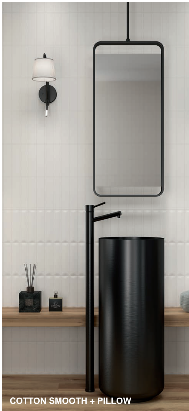
COTTON SMOOTH + PILLOW