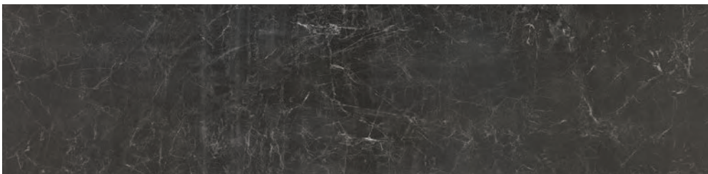
Nero Greco Polished** - F0373 - 5.6 (Walls) - Stocking at factory

**Polished finishes require a penetrating sealer prior to grouting. Please Note: Due to DCOF value, these tile panels are not recommended for applications in wet areas or areas where standing water may occur.