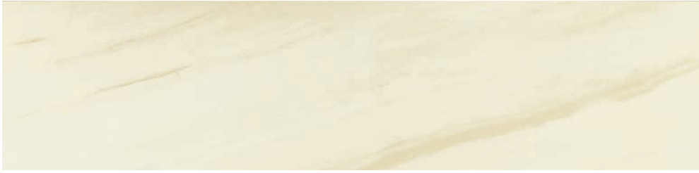
Bianco Lasa Polished** - F0375 - 5.6 (Walls) - Stocking at factory